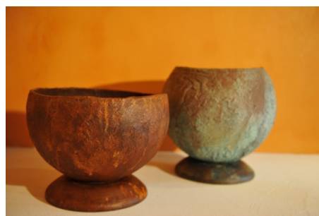
RUSTY AND VERDIGRIS PLASTER JARS